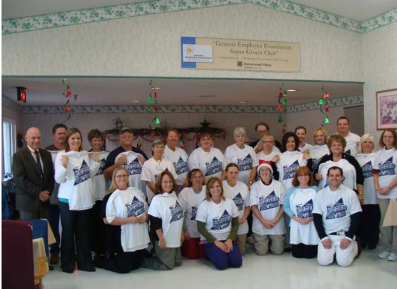
Ravenswood joins 8 other sister Super Giver centers in West Virginia!

Way to go to two centers on reaching Super Giver status! Each of these locations has 90% or more of staff contributing through payroll deductions. To celebrate this amazing accomplishment, each location held a celebration event for their staff where each employee received a Super Giver T-shirt and GEF presented the center a Super Giver banner to display at their location. In attendance were staff, area operators and the GEF Administrative Team.