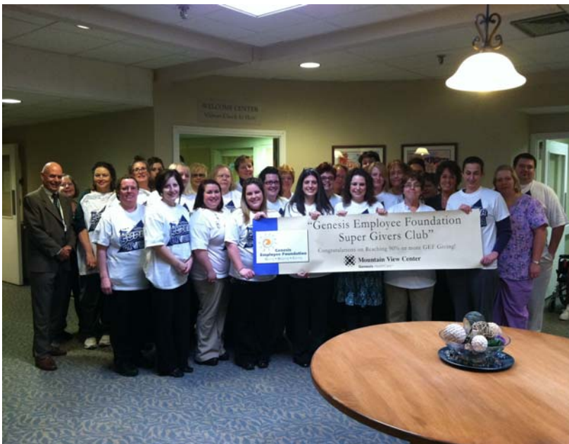
Mountain View Center celebrates being the first Super Giver Center in Vermont!